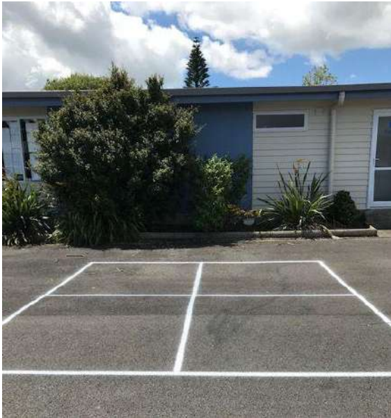
Mr Beran took advantage of the empty playground to paint "Four Square" lines on our asphalt.