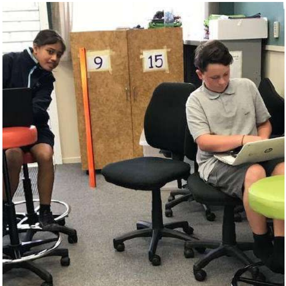
Robotics is not as easy as it looks!