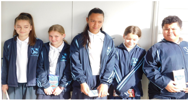
Week 7 Gotcha winners