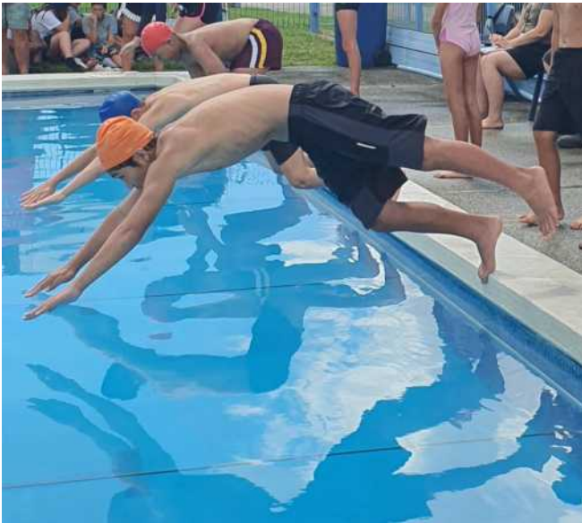
ATHLETES IN ACTION!