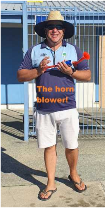
The horn blower!