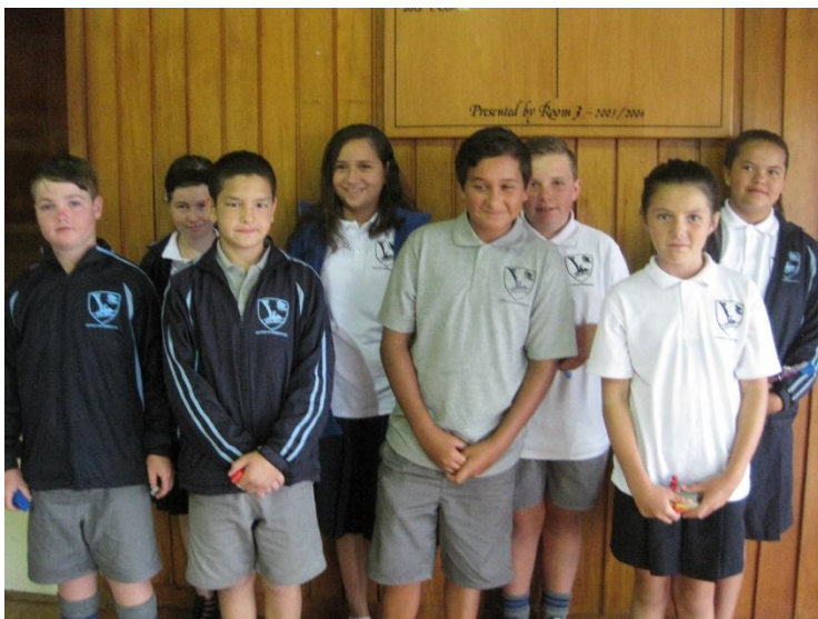
PB4L caught being good week 1 winners. Congratulations!

The school photos are scheduled to take place on Wednesday 24 February. The information and order forms were sent home last week. The photographer would prefer online orders and payment. This can be done on: www.lizdaviesphotography.co.nz